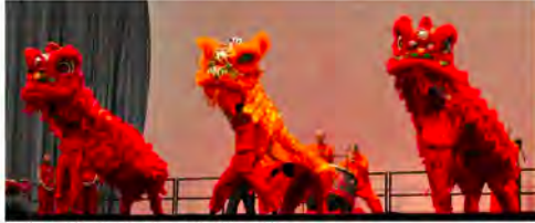
Lion dance.

chinadaily.com.cn | Updated: 2018-02-19 23:20