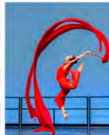
Brookfield Place teams up with the New York Chinese Cultural Center to put on a family-friendly show for Lunar New Year.

New Year Firecracker Ceremony Wear wrap-ups to this banger (there will be dragons), as 100,000 firecrackers are set off to banish unfriendly ghosts. At this spirited event, craft and food vendors sell traditional delicacies and art while Chinese dancers do their thing. Fill up on dumplings!