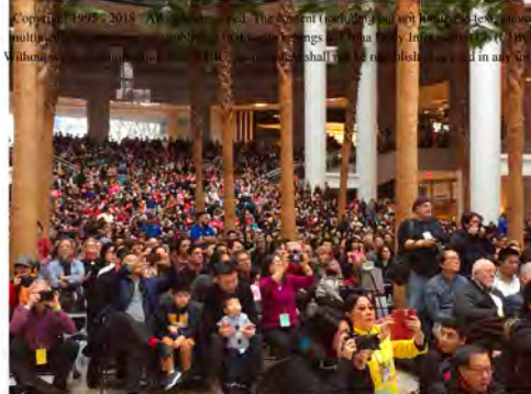
Manhattan's prestigious Brookfield Place was fully packed by enthusiastic New Yorkers on Saturday.

The performances included the lion dance, sword dance, silk fan dance, Shaolin kung fu, a ribbon dance, musical performances, and even one performer who juggled umbrellas with her feet. The performance began with an acrobat in a dog costume tumbling through the air to the tune of "Who Let the Dogs Out."