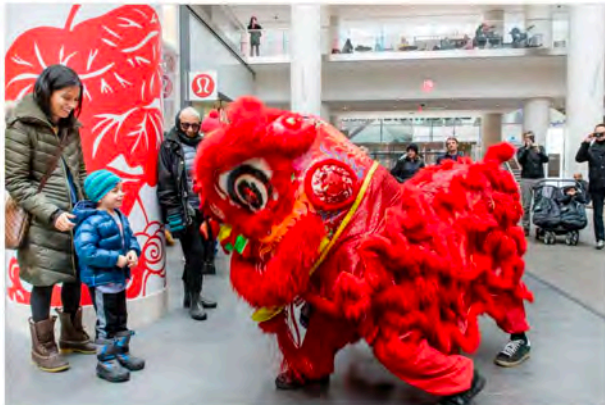
Brookfield Place teams up with the New York Chinese Cultural Center to put on a family-friendly show for Lunar New Year.

NEW YORK DAILY NEWS Sunday, February 11, 2018, 6:00 AM